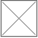
Figure 42: Default workflow recipients